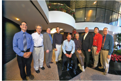
Image 5. When the original 8mm fisheye image was corrected using the Fisheye-Hemi 1 filter, all the people within the image and the outer edges of the photograph are beautifully corrected for distortion.