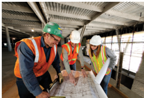
Image 2. When the original construction site image was corrected with the Fisheye-Hemi 2 filter, it produced a very pleasing rendition of the people and lines throughout the image.