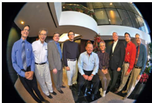
Image 4. This image of the Image Trends team in their in Austin, Texas, headquarters was shot with an 8mm fisheye. No fisheye correction has been made.