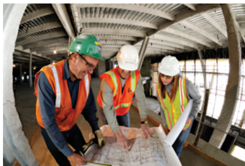
Image 3. In comparison, when the original construction site image was corrected with the rectilinear method of fisheye correction, the people in the image remain distorted, the original crop is lost, and the resolution is lost.